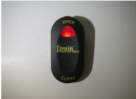
L.E.D. Light "ON"