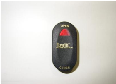
Center OFF Momentary Switch (light "Off")

If your boat has an LCD display and the Ballast system is controlled by it, you will need to refer to the manufacturers Ballast Operating Instructions for directions.