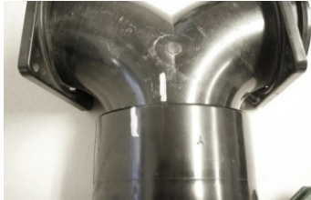
OUT OF ALIGNMENT