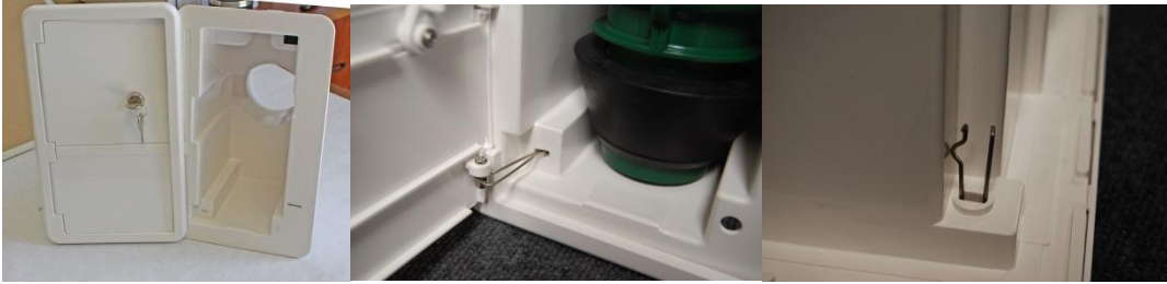
Spring latch inserted into enclosure